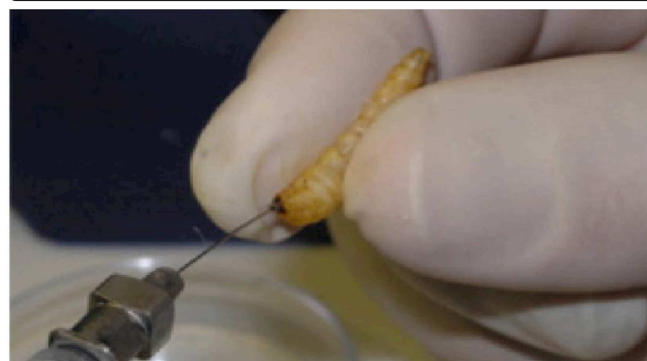
Figure 1. Gavaging of G. mellonella